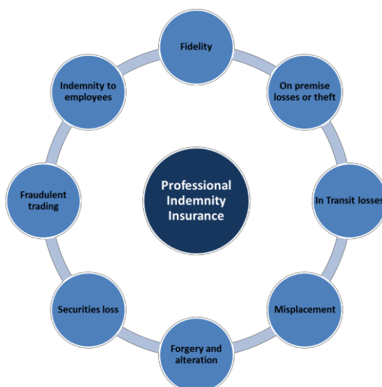
Figure 3 – Operation Risk – Professional Indemnity Insurance

Apart from managing operational risk, the Company also keeps capital as per the Basic Indicator Approach for calculation of Operational Risk Capital.